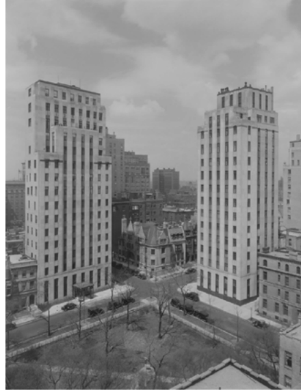
Exteriors, 1260 N. Astor (left) and 1301 N. Astor (right), 1932.

Caxton Club, Chicago Art Deco Society, and Chicago Collections are happy to present this popular program, originally scheduled for March of this year.